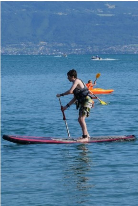
Stand up Paddle

Each participant will find a sport of choice with the holiday activities offered by our summer camp.