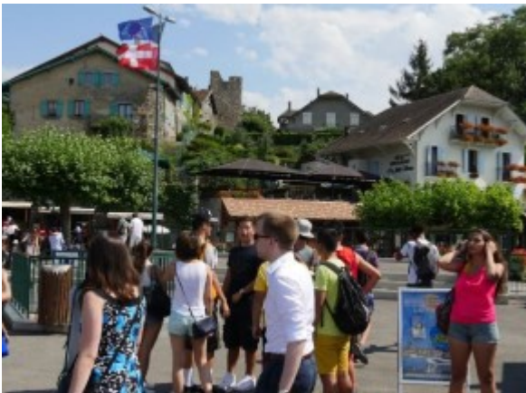
Visit of Yvoire